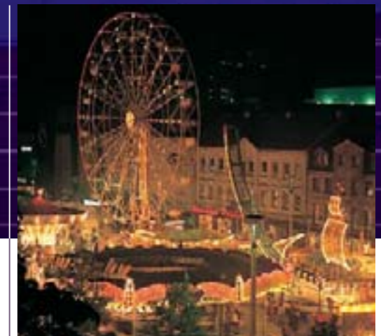
”Queen of Franconia’s Consecration Festivals”: Fürth Michaeliskirche (Michaelis Fair).

Where intensive effort goes into progress, leisure opportunities are a must. Fürth has always been widely known for its leisure facilities. There is something for everyone. Lovers of traditional Frankish hospitality never miss Michaeliskirche, the consecration festival held in October, for instance. Illustrious, nationally renowned cabaret is to be found at the ‘Comödie Fürth’, the founders of which received an award for their innovative ideas. But the Fürth program also includes stylish theatre performances, musicals, dance shows and other productions. First-rate guest performances and Stadttheater Fürth’s own productions, international artists appearing in Stadthalle Fürth (Civic Hall), concerts and cabaret in the newly renovated Kulturforum Fürth, and football fans can enjoy watching SpVgg Greuther Fürth play exciting 2 nd division games in the Trolli stadium – something to suit every taste.