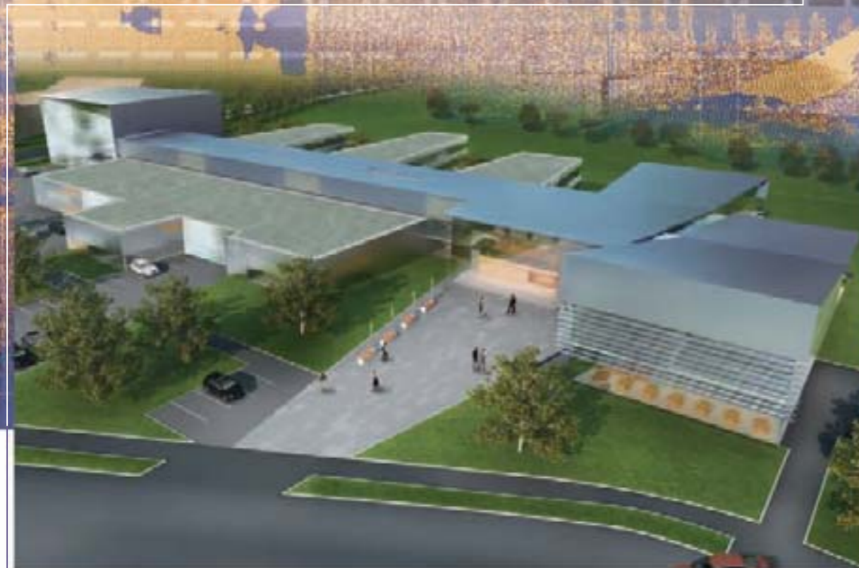
Model of the planned Fraunhofer building in the Golfpark.