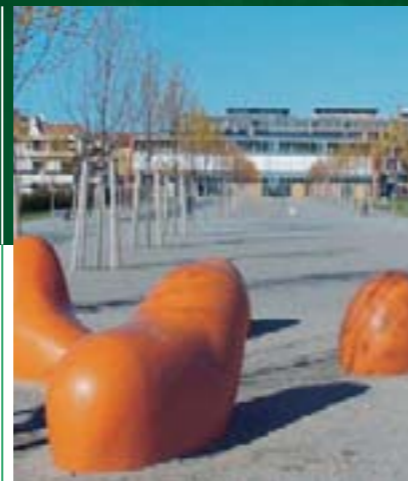
Lots of space on 30 hectares: the new Südstadtpark.