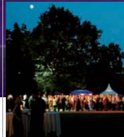
Impressive backdrop to Bavaria's largest open-air ballroom: the Summer Night Ball in the Stadtpark (Municipal Park).