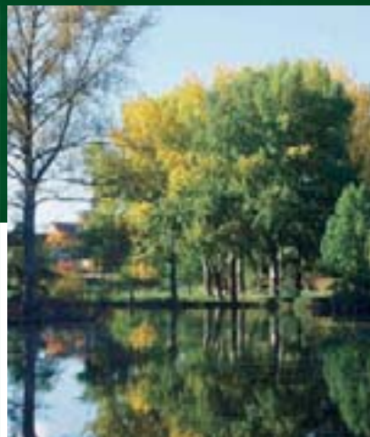
Unwinding right in the middle of town: the meadowland.

700 hectares of water meadows, 520 hectares of woods, a wonderful park – relaxation and rest galore in the clover leaf city. The degree of proximity to nature experienced in Fürth is quite unique, much greater than large cities normally provide. Fürth not only has green, open spaces just a few minutes walk from the center, but also lovingly kept parks and mature trees that introduce variety to the built up areas, making it possible to live in the heart of nature. And it is not necessary to travel far from Fürth for an enjoyable weekend. The “Neue Fränkische Seenland”, Franconian Lake District, and the hills of the “Fränkische Schweiz”, Franconian Switzerland, are both close by, offering a multitude of leisure time activities.