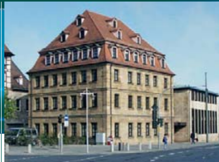
Central contact for entrepreneurs and investors: The Business Town Hall.

Our specialists will guide you through the bureaucratic jungle, advise and support you in every way, cut red tape and supply information about available financial support. No questions are left unanswered – committed, expert advice guaranteed. It was not without good reason that the service-orientated attitude of the Fürth City Council was presented with the Bavarian “Business-Friendly Council” award in 2002. Why not challenge us – make use of our outstanding service package.