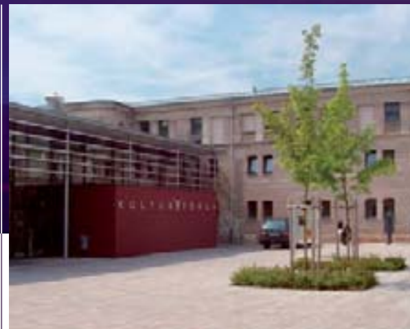
Partnership between city, business and culture: the Kulturforum.