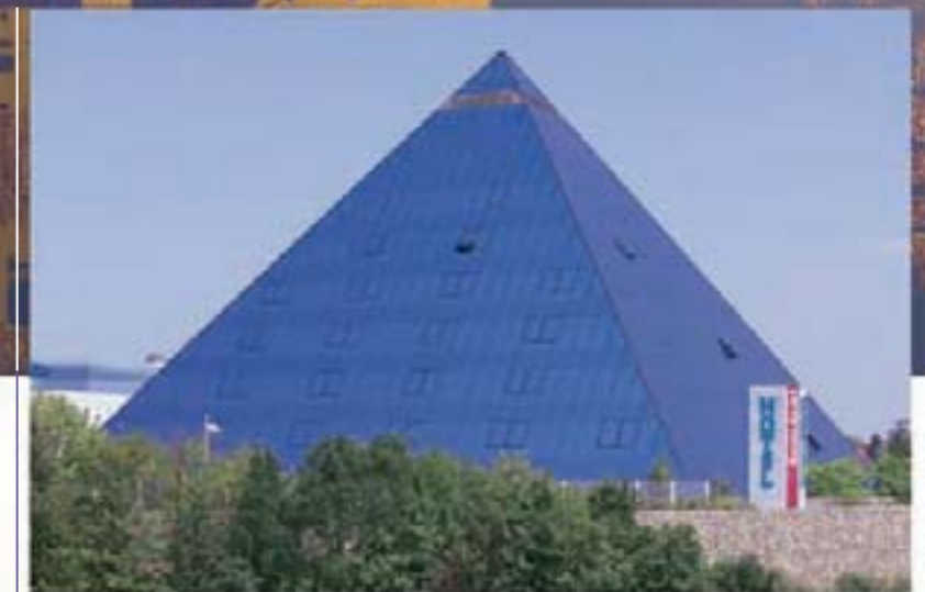
Symbol of modern Fürth: congress and conference hotel Pyramide.