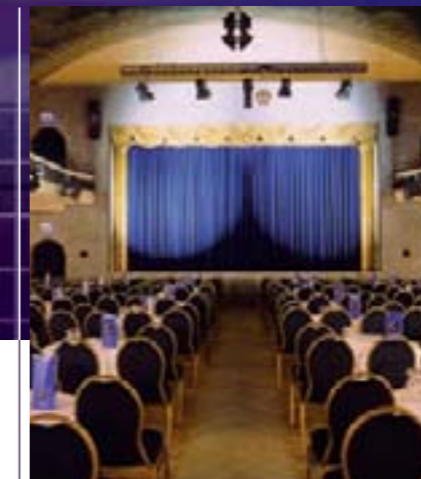
Drawing an audience from far beyond the region: Comödie Fürth.