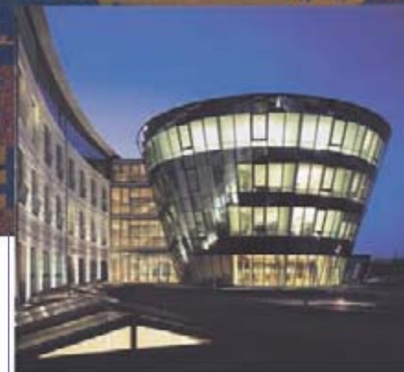
Holistic health concept in modern ambience: EuromedClinic Fürth.