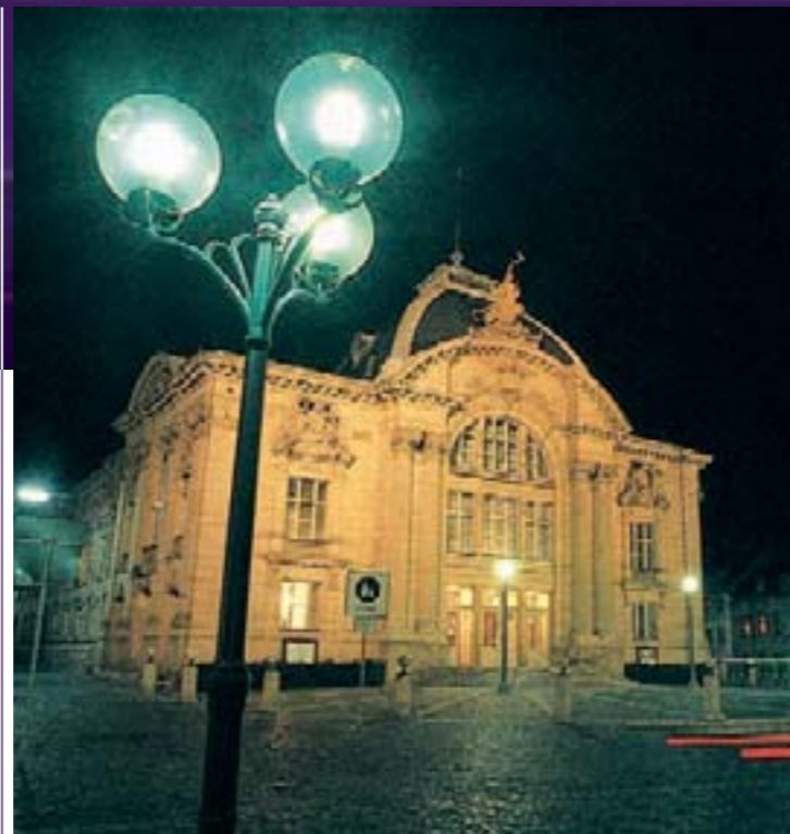
Productions on a grand scale: Stadttheater Fürth (Municipal Theatre).