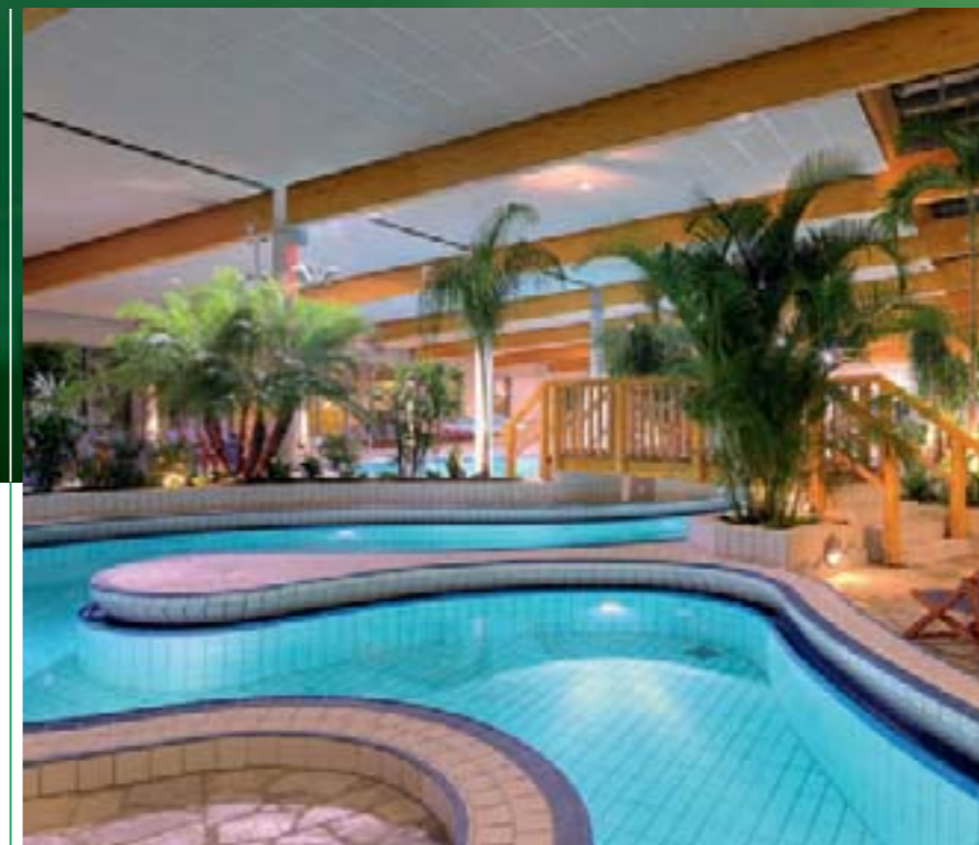
All year round holiday feeling: the “fürthermare” thermal spa and water park.