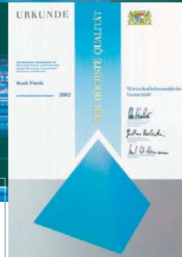
Bavarian Quality Award: Fürth has one of Bavaria's most business-friendly local authorities.